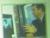
TANDBERG... it's light years ahead! Business 2.0